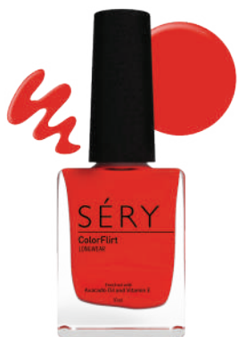
ORANGE PUNCH AO 03 COLORFLIRT NAIL ENAMEL