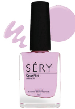
PRINCESS GRACE AO 17 COLORFLIRT NAIL ENAMEL