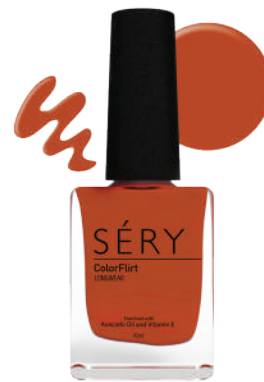
CARAMEL BITE AO 24 COLORFLIRT NAIL ENAMEL