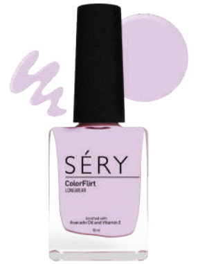
SOOTHING LILAC AO 18 COLORFLIRT NAIL ENAMEL