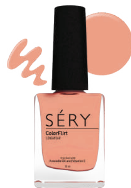
CORAL CRUSH AO 06 COLORFLIRT NAIL ENAMEL