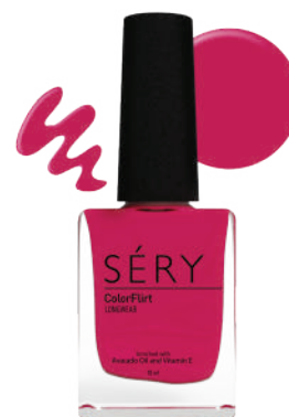
PETAL PINK AO 09 COLORFLIRT NAIL ENAMEL