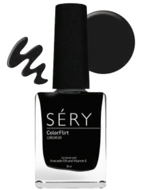
CHARCOAL BLACK AO 22 COLORFLIRT NAIL ENAMEL