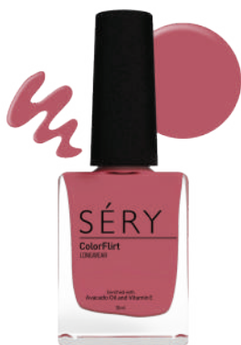
GLAZING PINK AO 11 COLORFLIRT NAIL ENAMEL