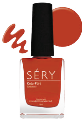
RUSTIC ORANGE AO 23 COLORFLIRT NAIL ENAMEL