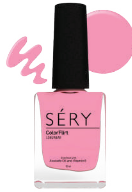
SOFT MARSHMELLO AO 14 COLORFLIRT NAIL ENAMEL