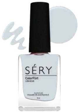
SEA BED AO 19 COLORFLIRT NAIL ENAMEL