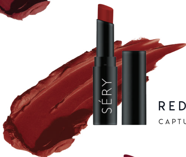
RED RUSH(ML06) CAPTURE D'MATTE LASTING LIP COLOR