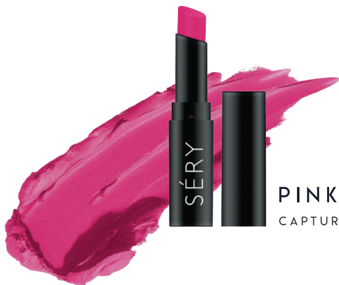
PINK PEPPER(ML18) CAPTURE D'MATTE LASTING LIP COLOR