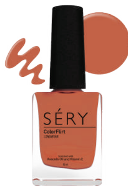
CIDER SPICE AO 26 COLORFLIRT NAIL ENAMEL