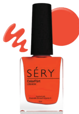
FIRE ORANGE AO 05 COLORFLIRT NAIL ENAMEL