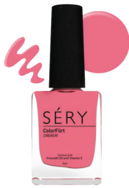
POP PINK AO 13 COLORFLIRT NAIL ENAMEL