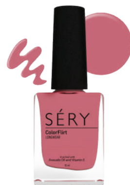
RUSTIC CHARM AO 10 COLORFLIRT NAIL ENAMEL