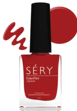
CHERRY BERRY RED AO 02 COLORFLIRT NAIL ENAMEL