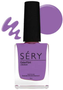
TRICKY PURPLE AO 15 COLORFLIRT NAIL ENAMEL