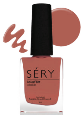
COFFEE FOR ME AO 27 COLORFLIRT NAIL ENAMEL