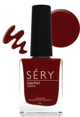
DREAMY PLUM AO-01 COLORFLIRT NAIL ENAMEL