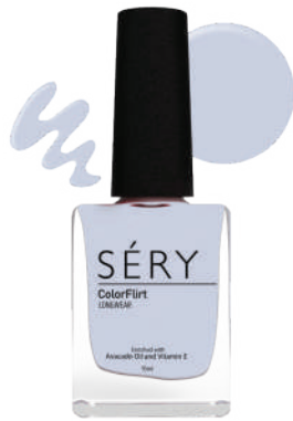
SHADOW GREY AO 20 COLORFLIRT NAIL ENAMEL