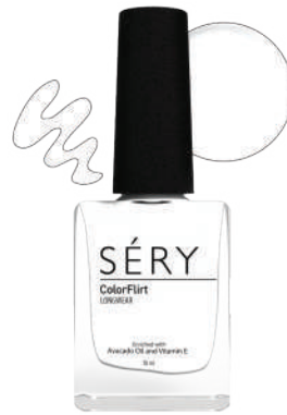
WHITE BEAUTY AO 21 COLORFLIRT NAIL ENAMEL