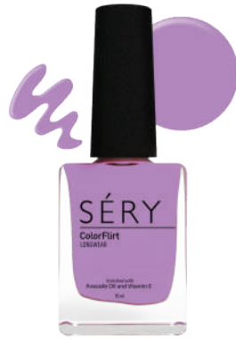
LAVENDER AO 16 COLORFLIRT NAIL ENAMEL