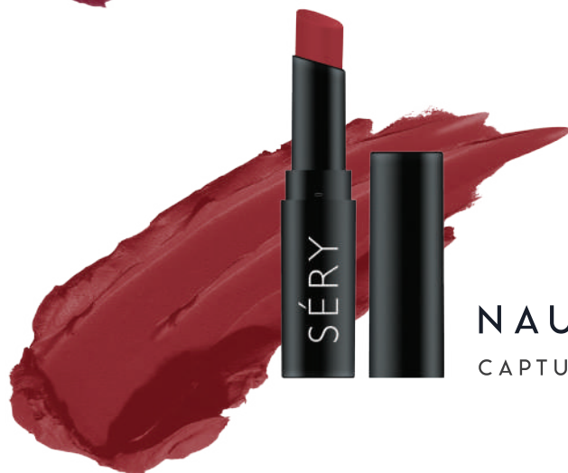
NAUGHTY NUDE(ML08) CAPTURE D'MATTE LASTING LIP COLOR