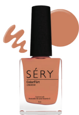
SOFT ALMOND AO 25 COLORFLIRT NAIL ENAMEL