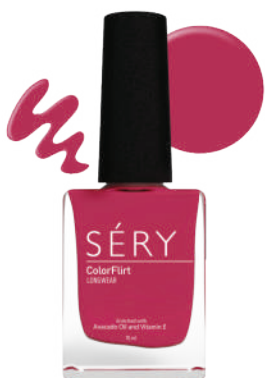
PINK PLAY AO 08 COLORFLIRT NAIL ENAMEL