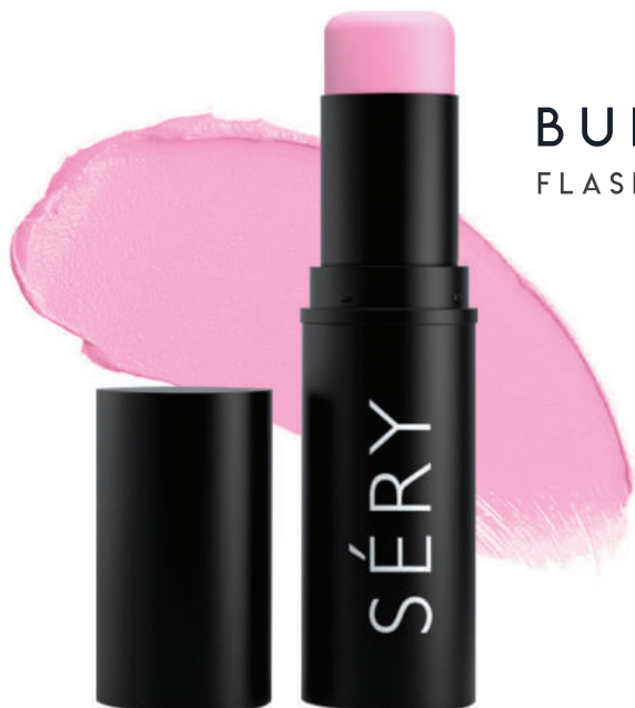
BUBBLE BUZZ (B1) FLASHLITE BLUSHER STICK