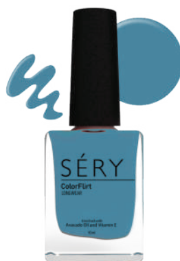
STEEL TEAL AO 29 COLORFLIRT NAIL ENAMEL