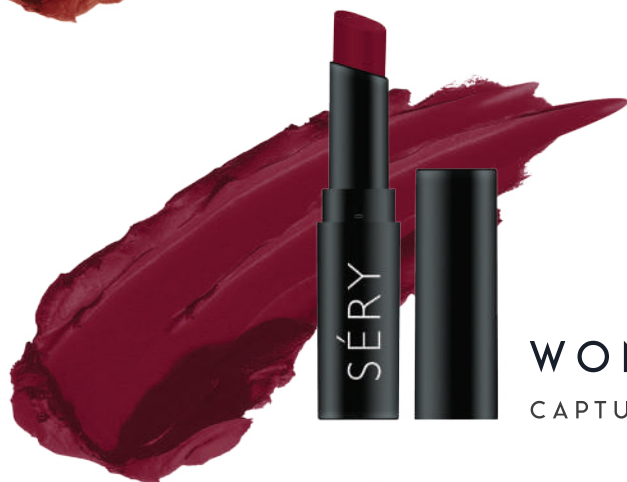
WONDER WINE(ML07) CAPTURE D'MATTE LASTING LIP COLOR