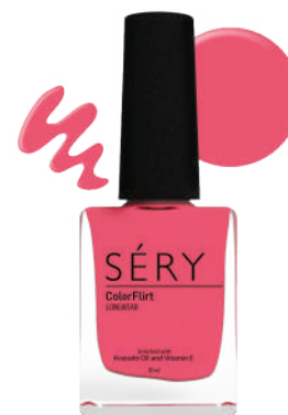
PINK PANACHE AO 12 COLORFLIRT NAIL ENAMEL