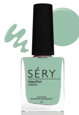
SEAFOAM AO 33 COLORFLIRT NAIL ENAMEL