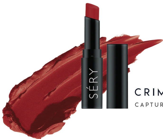
CRIMSON CHIC(ML17) CAPTURE D'MATTE LASTING LIP COLOR