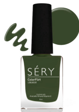
OLIVE THRILL AO 34 COLORFLIRT NAIL ENAMEL