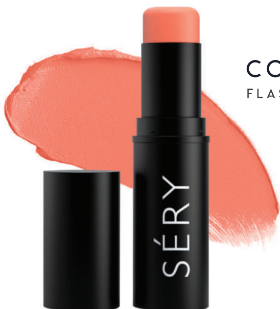
CORAL CAT (B3) FLASHLITE BLUSHER STICK