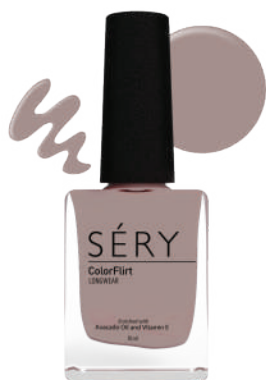
ASH GREY AO 28 COLORFLIRT NAIL ENAMEL