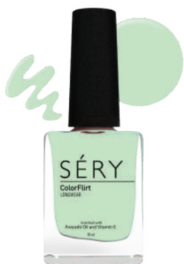
MINT AFFAIR AO 32 COLORFLIRT NAIL ENAMEL