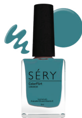
HAWAIIAN BLUE AO 30 COLORFLIRT NAIL ENAMEL