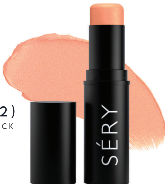
PEONY PEARL (B2) FLASHLITE BLUSHER STICK