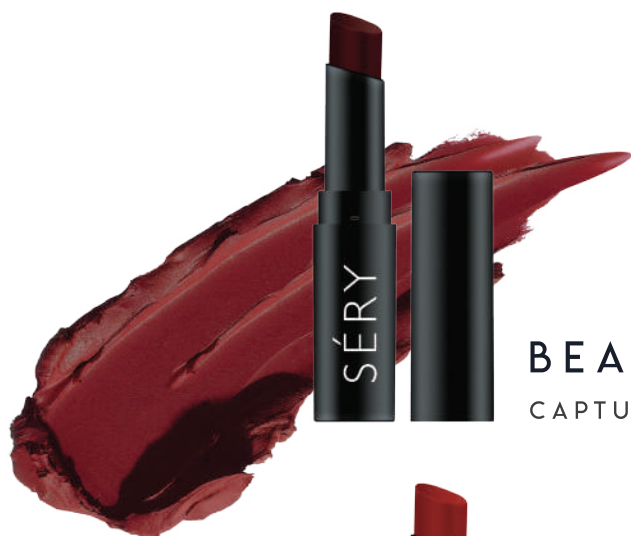
BEAUTY BRICK(ML05) CAPTURE D'MATTE LASTING LIP COLOR