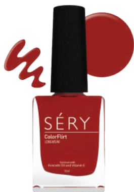
CRANBERRY CANDY AO 04 COLORFLIRT NAIL ENAMEL