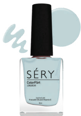
OCEAN BLUE AO 31 COLORFLIRT NAIL ENAMEL